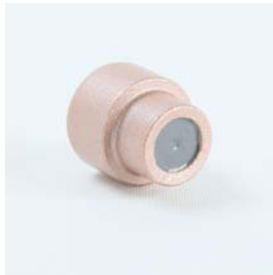
Illustration 2: TungStud cross-section drawing and photo