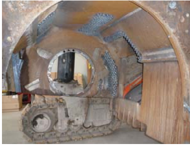
Illustration 1: Road-milling roller housing fitted with TungStuds